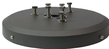
(Cover with Bollard Anchorage)