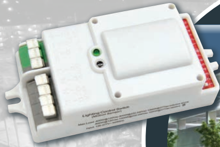
P17117 Internal Microwave Sensor

Many outdoor lighting projects in warmer climates require controls to work properly above 32°C. Warehouses without air conditioning also experience these high operating temperatures.