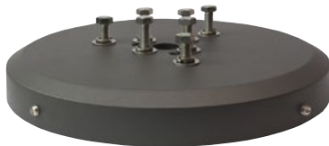
(Cover with Bollard Anchorage)